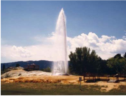
Soda Springs Geyser