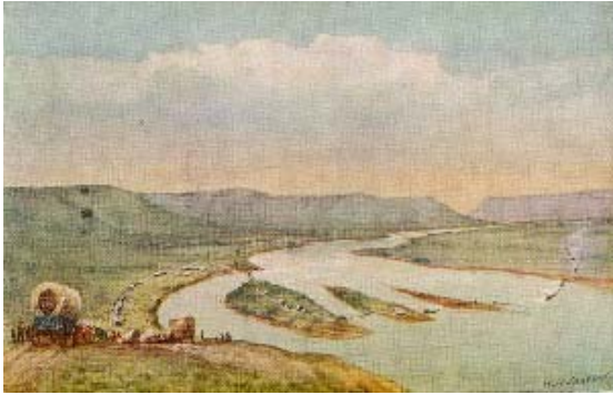
Three Island Crossing